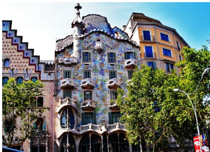
Casa Batlló (Barcelona) by Antoni Gaudí